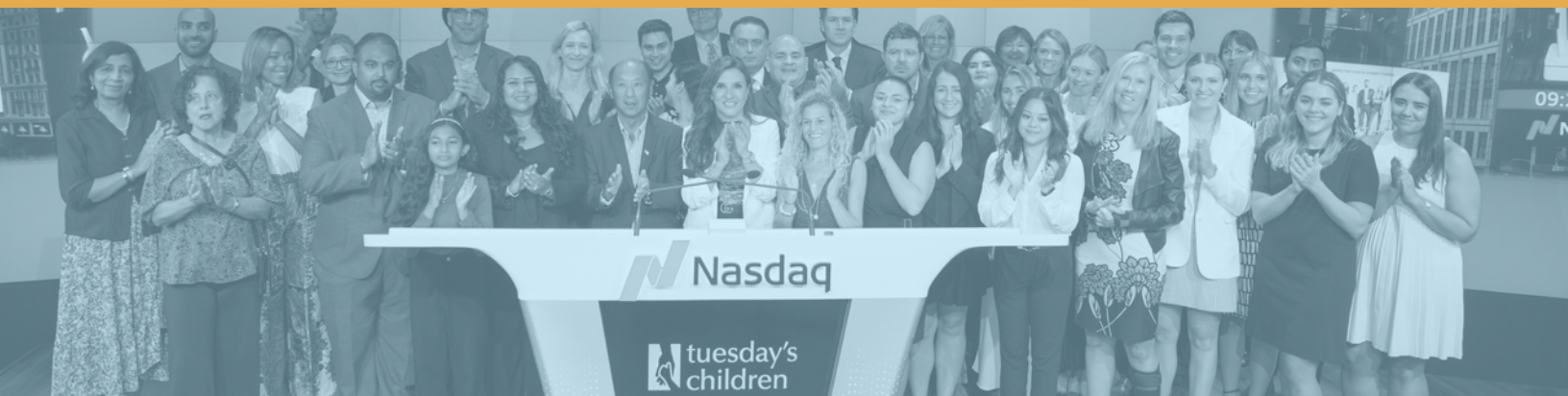
Tuesday's Children joined families, supporters, partners, and board members to ring the Nasdaq Opening Bell, acknowledging the 22nd anniversary of the September 11th terrorist attacks.